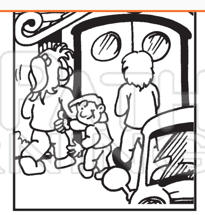
Going to a restaurant