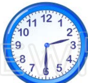
half past 2