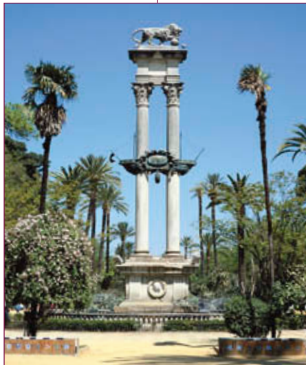
PREVIOUS PAGE: Christopher Columbus, an Italian seaman living in Portugal, convinced Queen Isabella of Spain to fund his first voyage west across the Atlantic Ocean in 1492.

Eventually, Columbus convinced Queen Isabella of Spain. She and King Ferdinand agreed to all his requests. Finally, on August